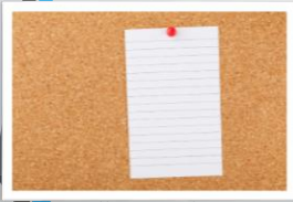
Adding a Picture Style